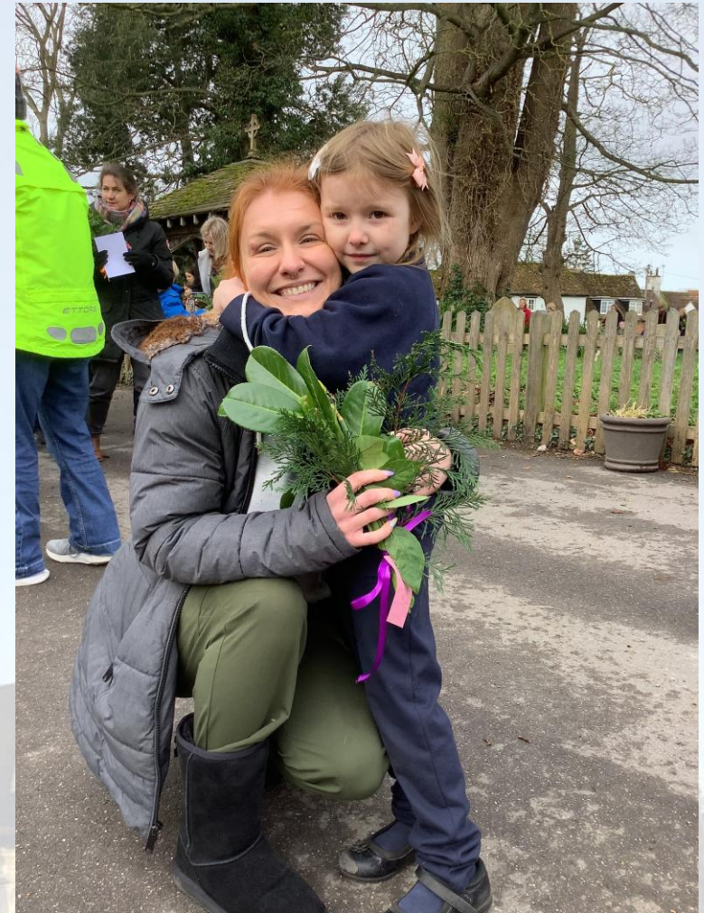
Mothers' Day 2026!