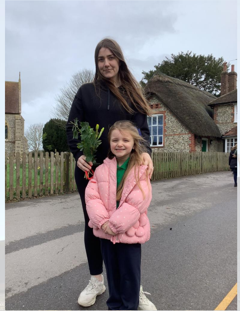
Mothers' Day 2026!