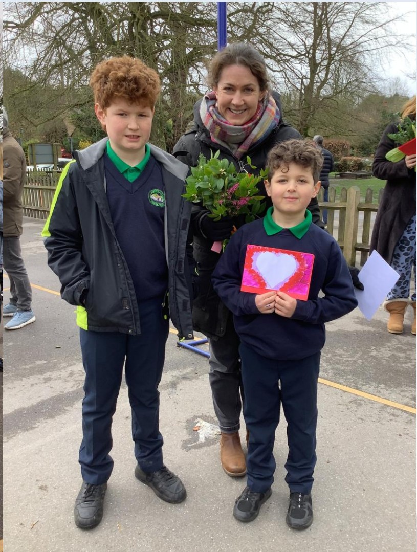
Mothers' Day 2026!