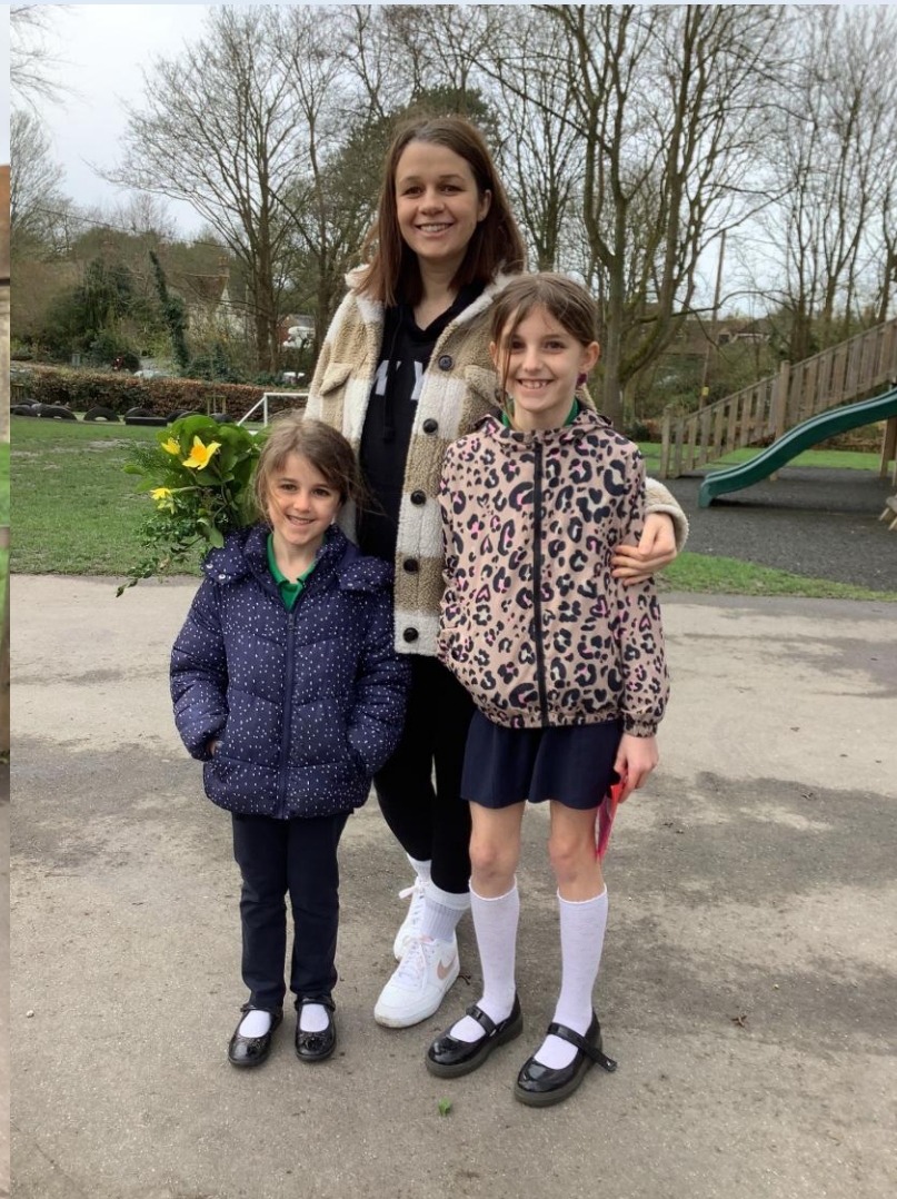
Mothers' Day 2026!