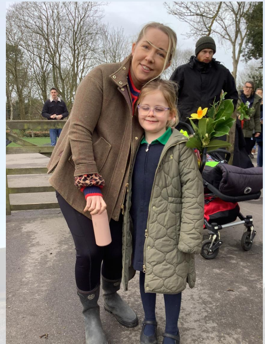
Mothers' Day 2026!