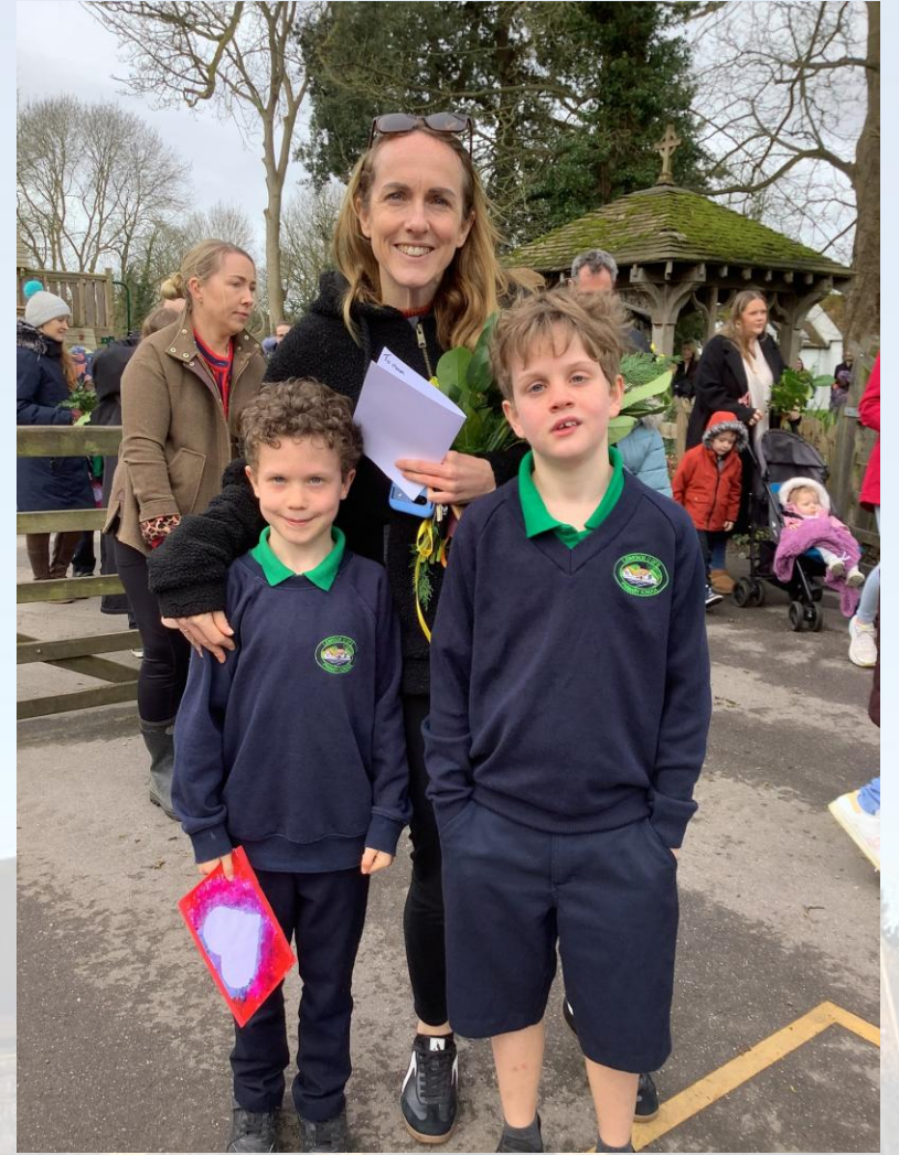
Mothers' Day 2026!