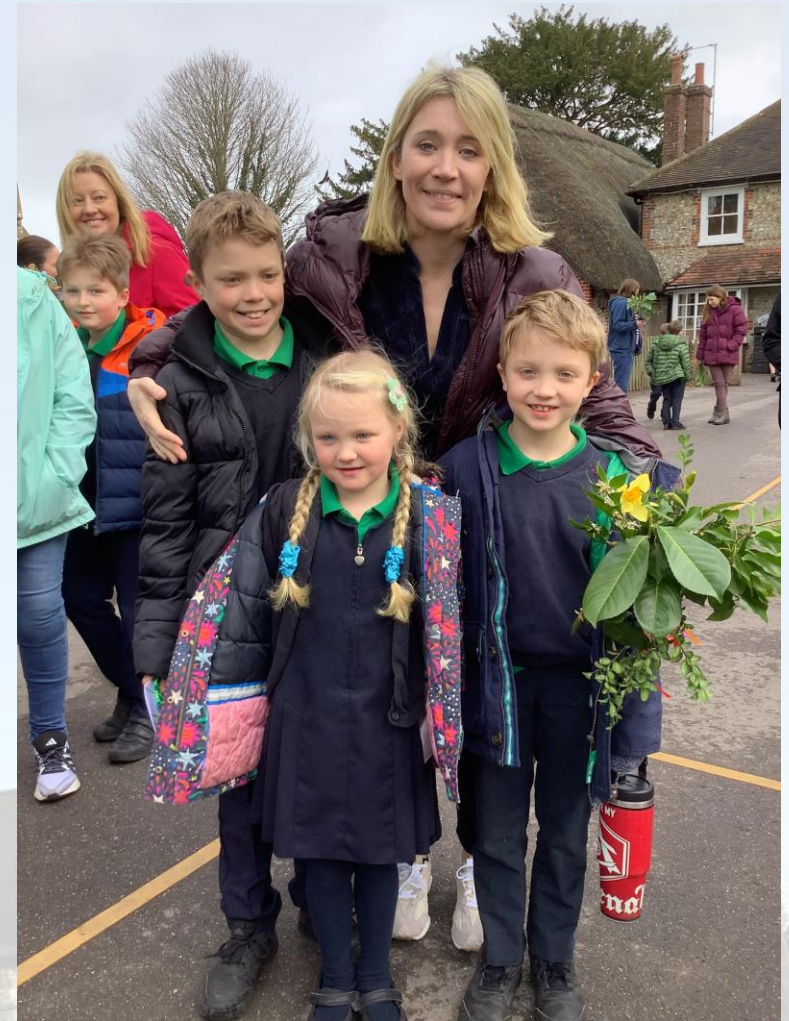
Mothers' Day 2026!