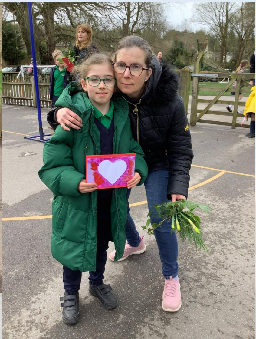
Mothers' Day 2026!