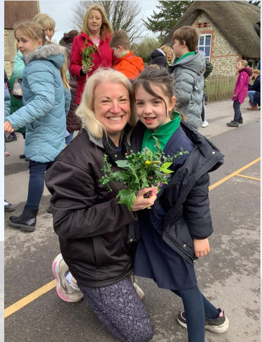
Mothers' Day 2026!