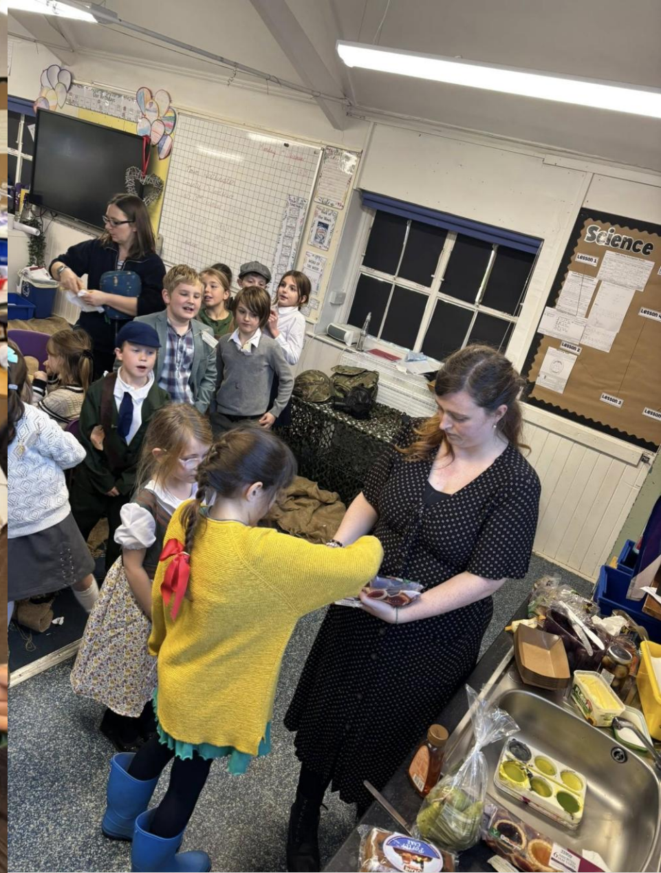
Lower Juniors evacuation day.