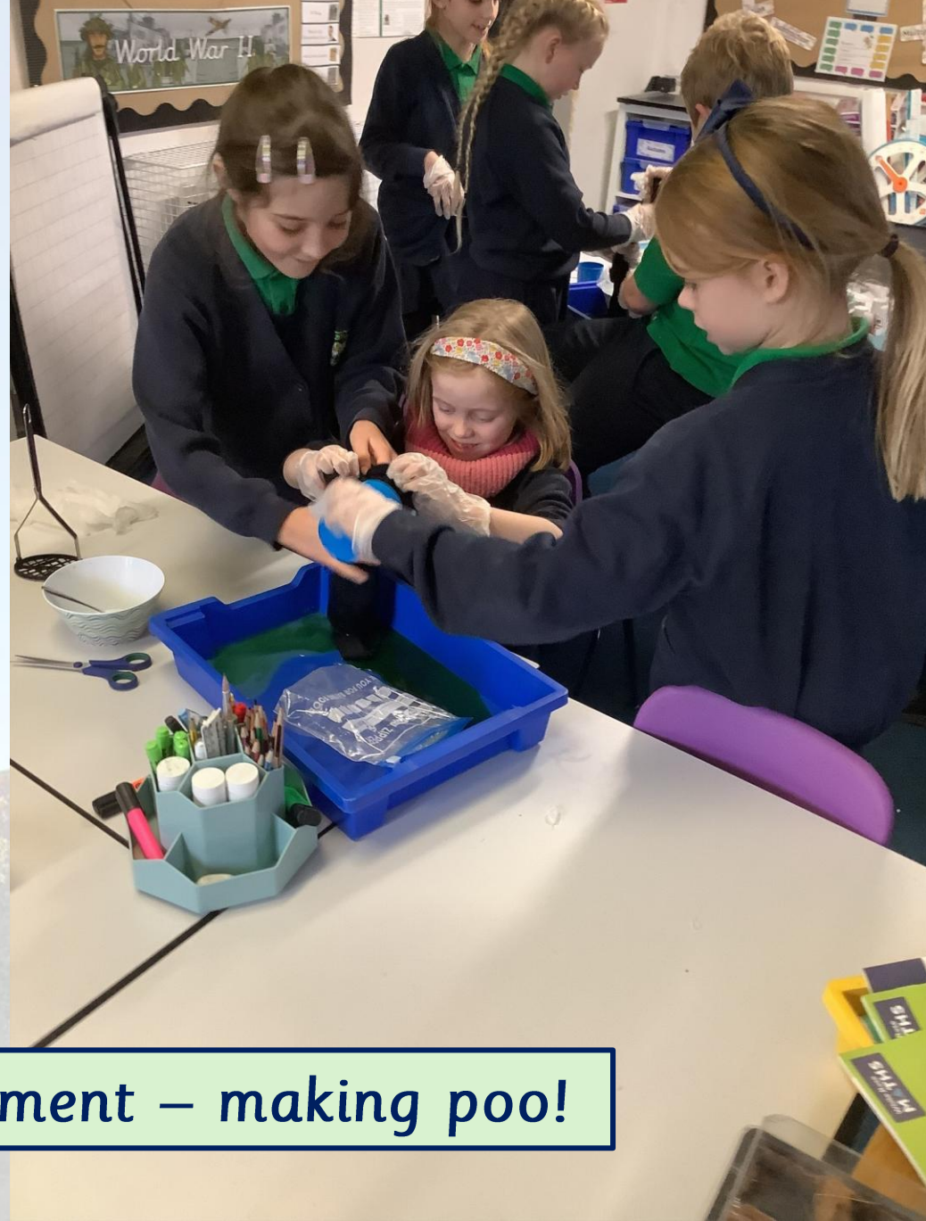
Lower Juniors Science experiment – making poo!